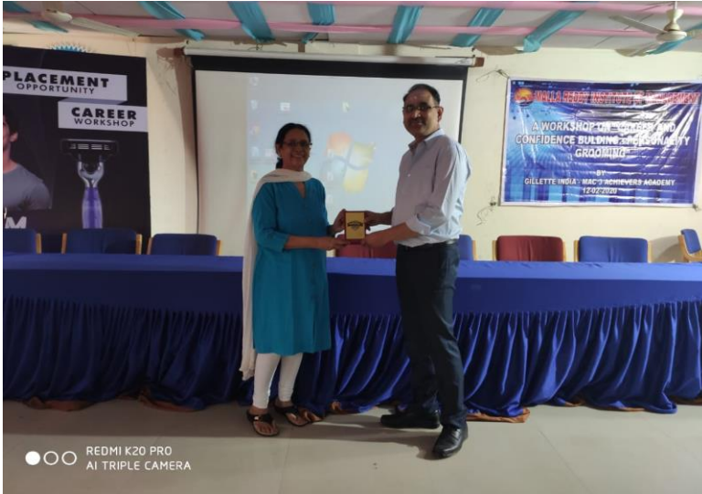
A memento was presented by Gillette India-Mac3 Macho Achievers Academy to college